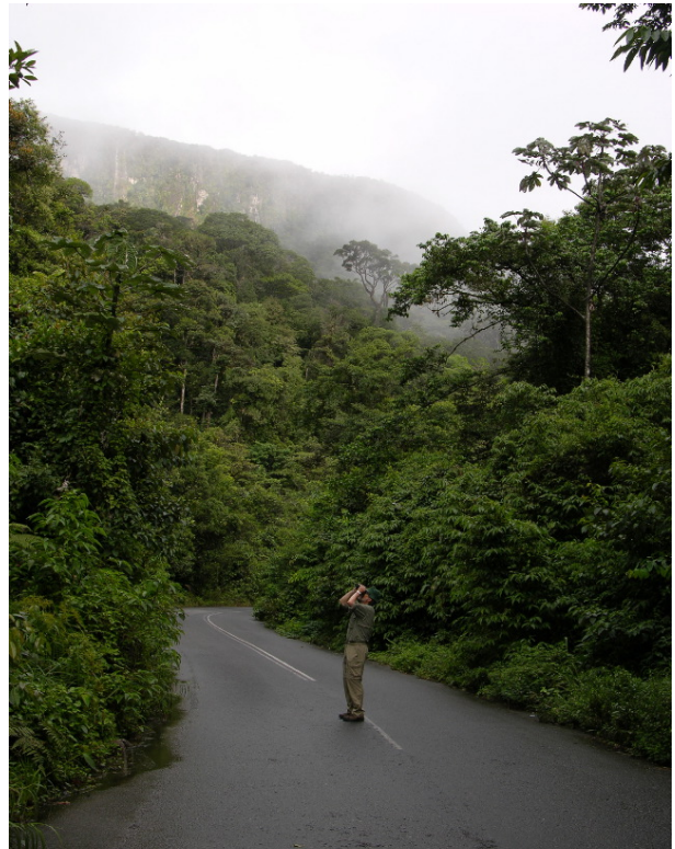
Sierra de Lema. D.Ascanio

Rains were present some times at noon and only added more birding experiences within a single day. As you know by now, the rainy season in the tropics does not means a "rain all-day-long" and instead is usually a refreshing and powerful shower that activates the bird life for the afternoons. Tour participants mentioned several memorable times and favorites were the sunset at the wetlands of El Palmar, the views of White-plumed and Rufous-throated antbirds, the Rufous-winged Ground-Cuckoo glimpsed in the forest, a scope view of a Tiny Hawk feeding on a Pectoral Sparrow, the enchanting Musician Wren singing on a twig for several minutes, the Crimson Topaz displaying over the Rio Grande, two species of Crake