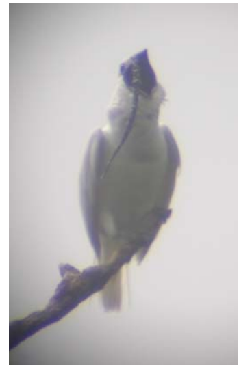
White Bellbird in the scope. D.Ascanio