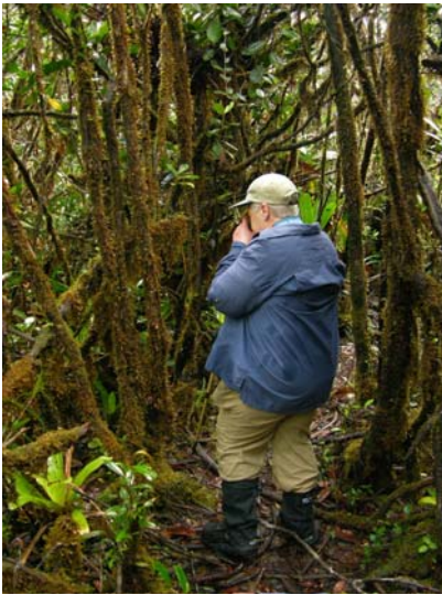
Moss-rich Tepui vegetation. D.Ascanio

pe to see you again in the tropics of America, a region with a tremendous ornithological history and still so much to be learned!