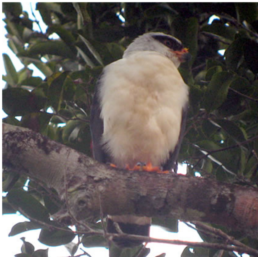
Black-faced Hawk Leucopternis melanops