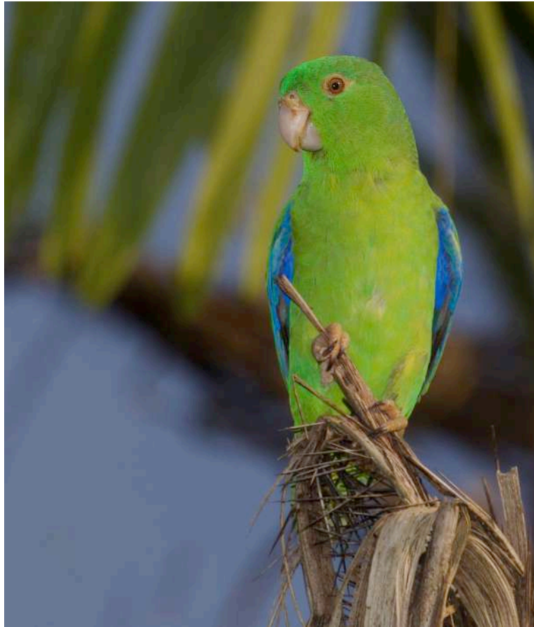
Blue-winged Parrotlet, Forpus xanthopterygius.