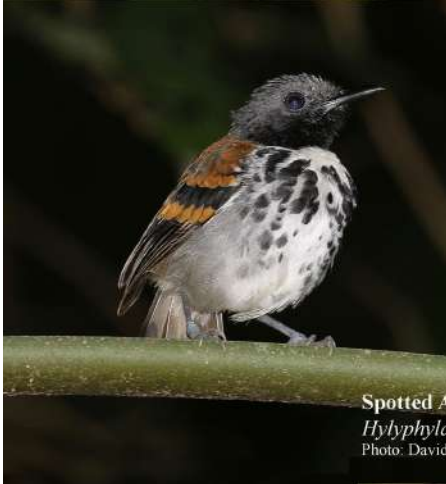
Spotted Antbird Hylophylax naevioides