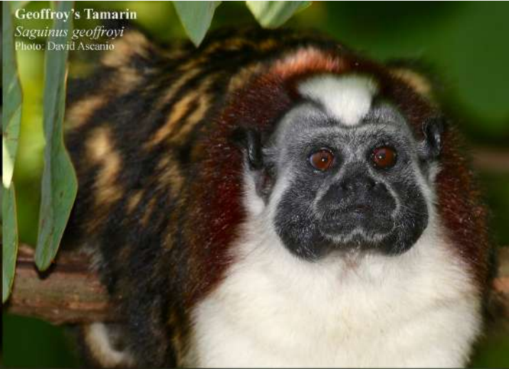
Geoffroy's Tamarin Saguinus geoffroyi