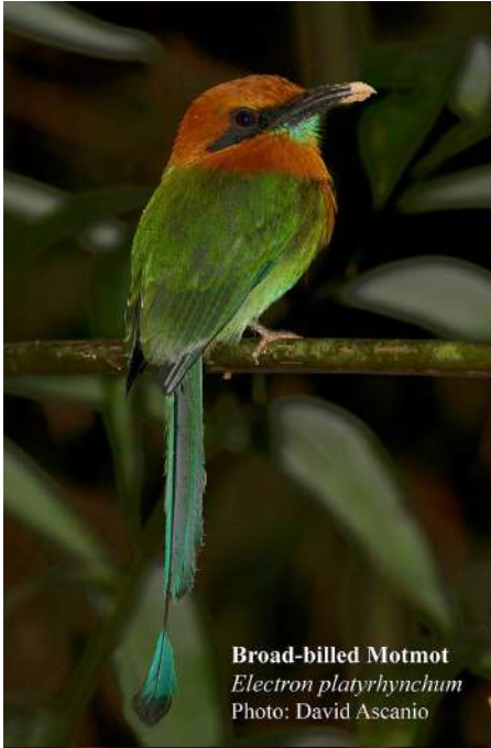
Broad-billed Motmot Electron platyrhynchum