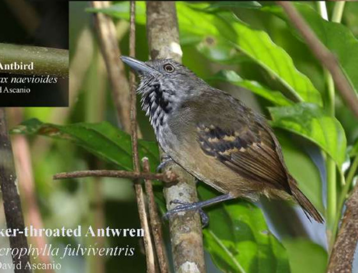
Checker-throated Antwren Epinecrophylla fulviventris

VENT Panama's Canal Zone A relaxed & easy tour David Ascanio